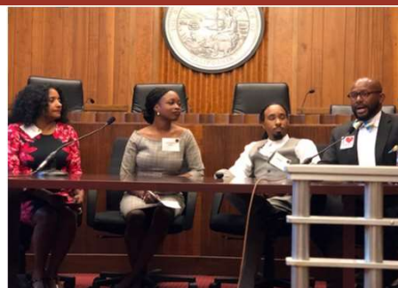
The Patient Experience