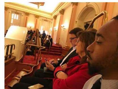
Educating Elected Officials